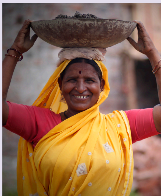
Village Health Worker in the village of Jawalke, Maharashtra, India